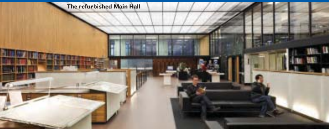
The refurbished Main Hall

Work was completed in January 2010 and the transformation of the study environment and the other public spaces has been dramatic. Feedback from users has been very positive and we are delighted that we can now provide a modern research Library service in this fine grade II* listed building. The quality and sensitivity of the work has been recognised by the receipt of a Royal Institute of British Architects White Rose Gold Award for Architecture. The scheme was also placed first in the Conservation Award and the Interior Award categories.