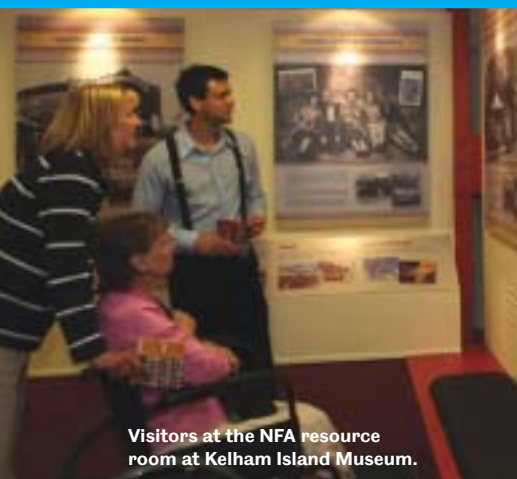
Visitors at the NFA resource room at Kelham Island Industrial Museum.

increased. Recent developments in the city have resulted in the opening of a new National Fairground Archive resource room at Kelham Island Industrial Museum. To celebrate this collaboration with Sheffield Industrial Museums we presented a free event recapturing the 1940s Wakes Weekend / Holidays at Home which attracted over 5,000 visitors. Our outreach in the city has attracted over 75,000 visitors to NFA-related events including Sheffield Fayre at Norfolk Park, Fright Night and Winter Wonderland at the Botanical Gardens.