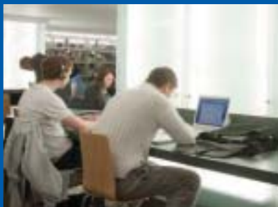
New group and individual study places on Level 4

Customers will notice a big change on Level 4 where we have created group study rooms, open access study spaces, study carrels and additional seating to make the whole area much more attractive for study. A new ceiling and new lighting have also helped created a far more user-friendly environment. On Level 3, new study spaces and casual seating have been introduced to make the Level 3 collections easier and more convenient to use. We estimate that approximately 200,000 items of stock had to be moved by our Capacity Management Team to enable the works to take place and as part of our programme to make our print collections easier to use.